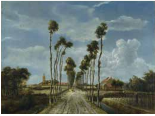
fig. 17 Meindert Hobbema The Avenue at Middelharnis , 1689 National Gallery, London, Great Britain