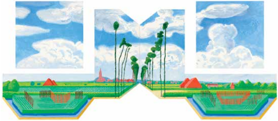
fig. 18 Tall Dutch Trees After Hobbema (Useful Knowledge) 2017 acrylic on 6 canvases 63 1/2 x 144" overall

In the current instance, with these hexagonal paintings, he perpetrated an odd dreamlike still-life space with a half-dozen mountains of piled-up Leger-esque cylinders (one of them erupting!) scattered around a strange notched interior (pp. 46–50). Across another canvas, the “picture of a lion” was propped up (enigmatically sized) between a row of curtains and a jungle backdrop, all to one side of the reversed perspective composition, while to the other side, an Astaire-like figure sashayed up from out of an urban boulevard that tapered off into the far obverse distance (pp. 58–62). And so forth.