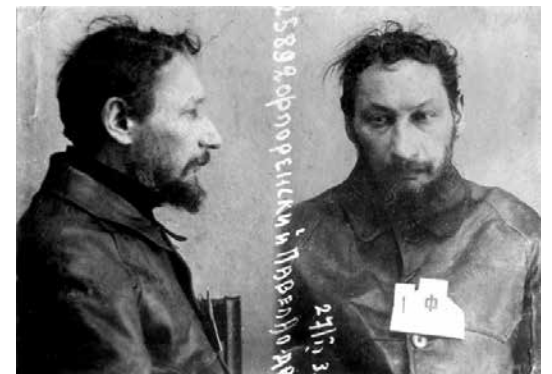
opposite, top : Pavel Florensky at time of ordination, 1911

You can see what thrilled Hockney. At one point, for example, Florensky wrote how "it was not in pure art that perspective arose, it came out of applied art sphere"—theater design in antiquity, and subsequently alongside the rise of positivist science on the far side of the Medieval era—"which enlisted painting in its service and subordinated it to its own purposes.