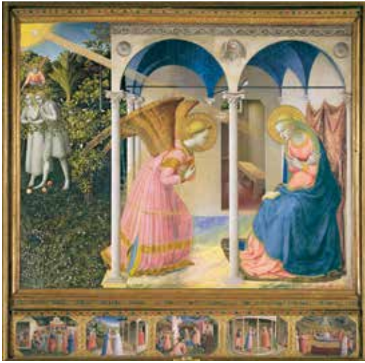
fig. 10 Fra Angelico, The Annunciation , c. 1426 Museo del Prado, Madrid, Spain

[However (Florensky continued),] the task of painting is not to duplicate reality, but to give the most profound penetration...of its meaning. And the penetration of this meaning, of this stuff of reality, its architectonics, is offered to the artist's contemplative eye in living contact with reality, by growing accustomed to and empathizing with reality, whereas theater decoration [for example] wants as much as possible to replace reality with its outward appearance.