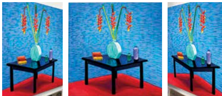
fig. 6 Halaconia in Green Vase , 1996 oil on canvas, 72 x 72"

magisterial vase had been placed looked entirely different depending upon the vantage (left, head-on, or right) from which the canvas was viewed (fig. 6):