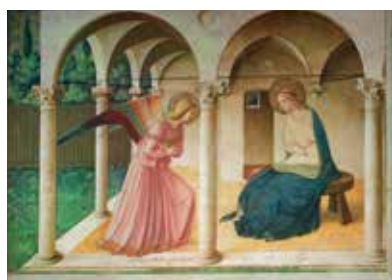
fig. 8 Fra Angelico, The Annunciation , around 1450. Fresco in the former dormitory of the Dominican monastery San Marco, Florence, Italy. Museo di San Marco, Florence, Italy. Annunciation II, after Fra Angelico from The Brass Tacks Triptych , 2017 acrylic on canvas, 48 x 96" (hexagonal)

Except that Hockney's own immediate associations were to an annunciation, the flowers in the left vase in full epiphany, those to the right reeling back in astonishment. This in turn reminded him of the poster of Fra Angelico's San Marco Annunciation (1437–46) that used to grace the upper corridor back in his days at Bradford Grammar School, one of his earliest favorite pictures ("for its clarity," he would recall, and its sublime definition in space). Whereupon he immediately launched into his own version, flipping the