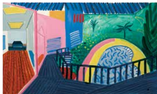
fig. 7 Terrace, Pool and Living Room, Feb. 1984 oil on canvas, 36 x 60"

Likewise, Hockney kept returning to the same few visual subjects (the Grand Canyon, the blue deck, and so forth), from different avenues of approach—approaches informed each time by his immediately prior investigations—arriving at fresh interpretations (some of them, however, uncannily similar) each time as if for the first time. Thus, for example, as far back as 1984, Hockney (coming out of his photo collages) rendered a reverse-perspective version of the blue deck that he seemingly had to struggle through the better part of three decades to attain once again in the mid-2010s (figs. 7 & 2).